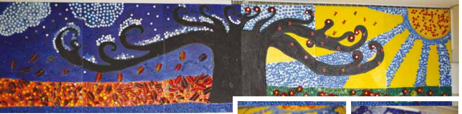
Al Ghobairi 2 nd school Chyah